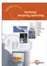
Brochure: Hardening, Tempering, Quenching