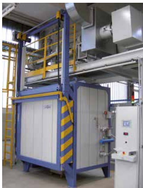
Gas-fired chamber furnace for de-binding and sintering in one process, with thermal waste gas purification system