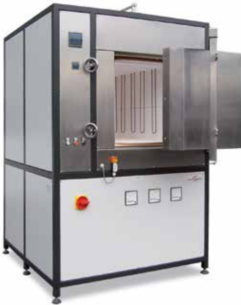
High temperature chamber furnace up to 1800 °C