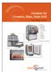
Brochure: Ceramic, Glass, Solar Cells,...