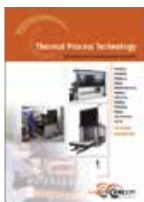
Brochure: Thermal Process Technology