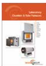
Brochure: Research and laboratory