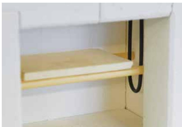
2 nd loading level for furnaces up to 1500 °C