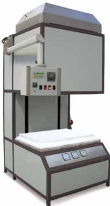
High temperature hood furnace up to 1800 °C