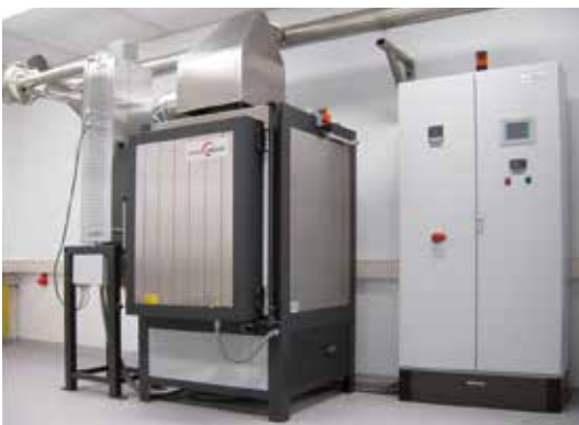
Chamber furnace up to 1400 °C for de-binding and sintering in one process, with catalytic waste gas purification system